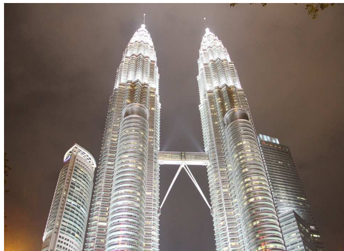
Petronas towers (Twin towers) Kuala Lumpur, Malaysia

Abstract. The purpose of this paper is to gather as much results of advances, recent and previous works as possible concerning the oldest outstanding still unsolved problem in Number Theory (and the most elusive open problem in prime numbers) called "Twin primes conjecture" (8 th problem of David Hilbert , stated in 1900) which has eluded many gifted mathematicians. This conjecture has been circulating for decades, even with the progress of contemporary technology that puts the whole world within our reach. So, simple to state, yet so hard to prove. Basic Concepts, many and varied topics regarding the Twin prime conjecture will be cover.