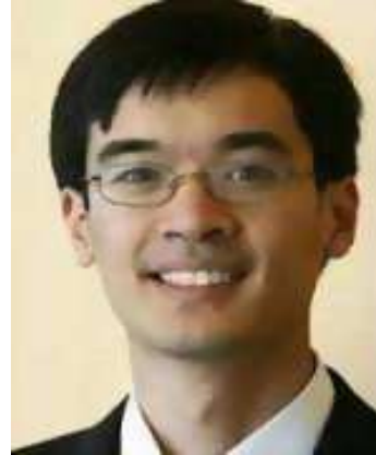
Terence Tao (University of California )

In fact, the attempts to prove "Twin primes conjecture" has seen great advances, shortly after Zhang's contribution, by June 4, 2013, Terence Tao , an Australian mathematician (born in 1975) of the University of California, Los Angeles , which has a remarkable academic career marked by international awards (he was a winner of the Fields Medal (2006)) and prestigious publications, had created an exceptional internet based project called "Polymath8 project" (Polymath8a & Polymath8b), an open, online collaboration to find more accurate and better estimates for improving the bound that attracted dozens of participants (of highly collaborative attitude) [23].