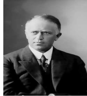
Viggo Brun (University of Oslo)