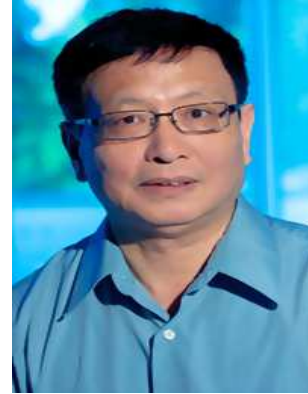
Yitang Zhang (University of New Hampshire )

On April 17, 2013 [6, 75]: the Chinese mathematician Yitang "Tom" Zhang (born in 1955) (a popular lecturer at the University of New Hampshire , which remained in the amber until April 2013) stunned the mathematical world (after many years of individual work) when he announced and proved a magnificent and beautiful result (called "the weak conjecture of twin prime numbers") (in Zhang's paper written with impeccable clarity and accepted by Annals of Mathematics Journal in early May 2013 [79]) which states that without any assumptions, there are infinitely many pairs of primes that differ by N , for some integer N that is less than 70 million [3, 6, 17, 18, 31, 40, 75, 79].